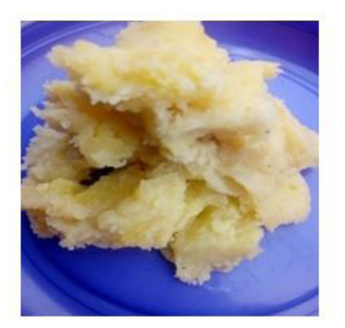
Plate 1: Dioscorea dumentorum

All subjects for the investigation fasted overnight. Their blood samples were collected through finger prick using a sterile lancet. Each blood sample was placed on a test strip which was inserted into a calibrated glucometer (Accu-Check Active Diabeter Monitoring Kit) which gave direct readings after 45sec based on glucose oxidase assay method. The determination of glucose level of the standard food was monitored at intervals of 0 min (fasting level), 15 min, 30 min, 45 min, 60 min, 90 min and