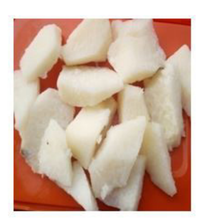
Plate 9: Dioscorea alata