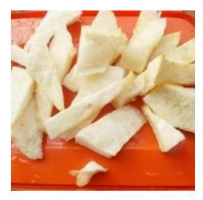
Plate 3: Dioscorea alata