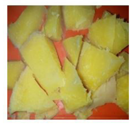
Plate 7: Dioscorea dumentorum