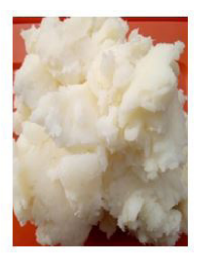
Plate3: Dioscorea alata