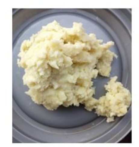
Plate 2: Dioscorea rotundata